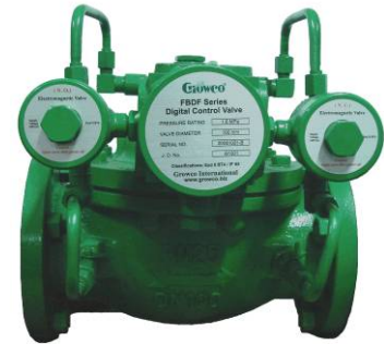
Typical Photograph of FBDF Series