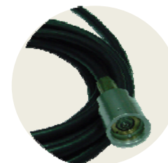
Typical Photograph of Overfill Probe