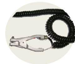
Typical Photograph of Grounding Clamp