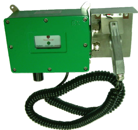
Typical Photograph of GCS Series for Top Loading Arms Application