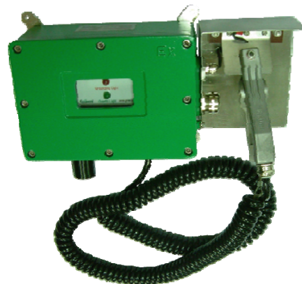
Typical Photograph of GCS Series for Top Loading Arms Application