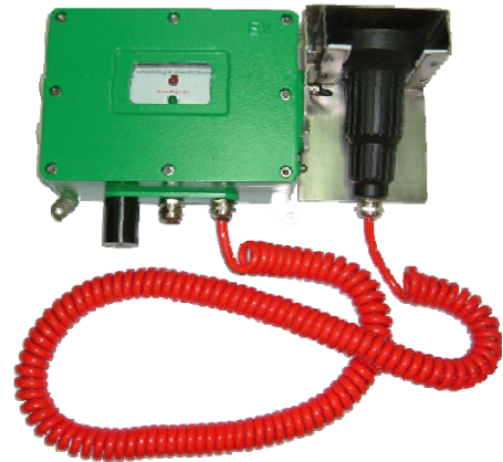
Typical Photograph of GPS Series for Bottom Loading Arm Application