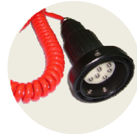
Typical photograph of Grounding & Overfill Prevention Plug