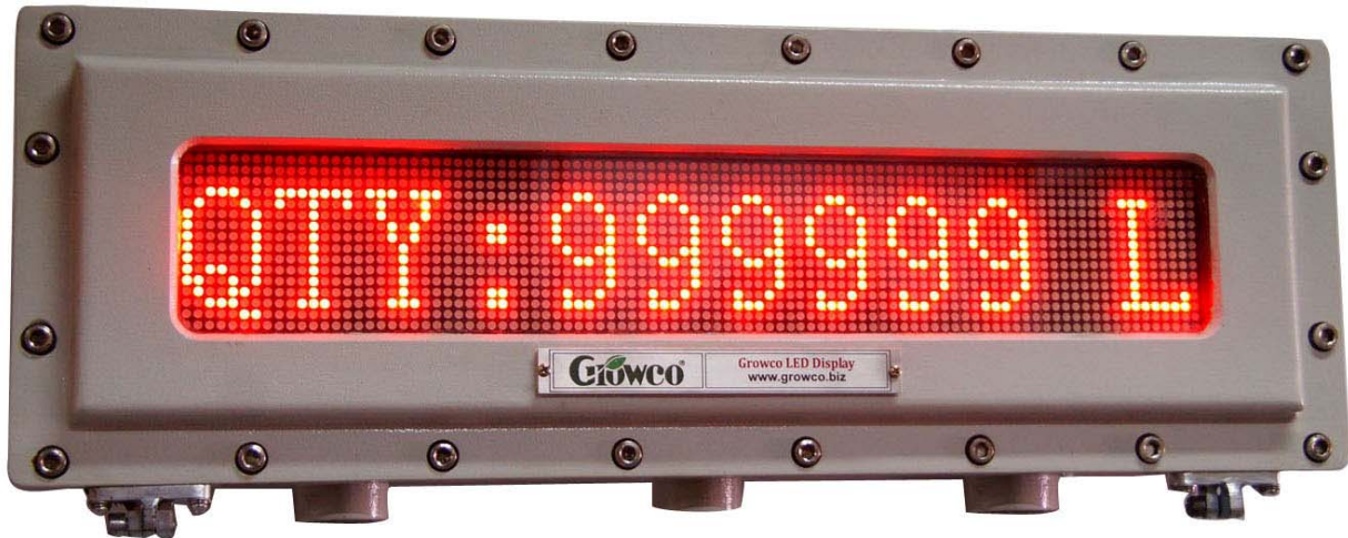
Above is Typical Photograph of Growco LED Display

Growco LED Displays are widely used in tanker truck loading terminals or depots for easy viewing of the loading volume when installed with terminal automation system or directly to Growco batch controllers. The LED Series displays are clearly visible in red colour to aid the operators or drivers at such terminals or depots during operations.