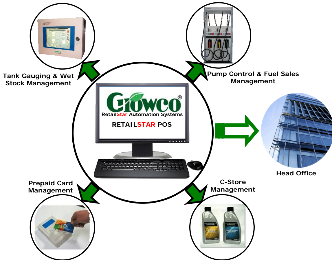
Figure 1: The Solution Architecture of our Automation System