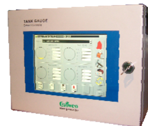
Typical Photograph of Smart Console with Colour Touch Screen