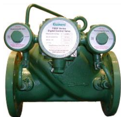
Digital Control Valves