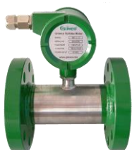
Liquid & Gas Turbine Meter