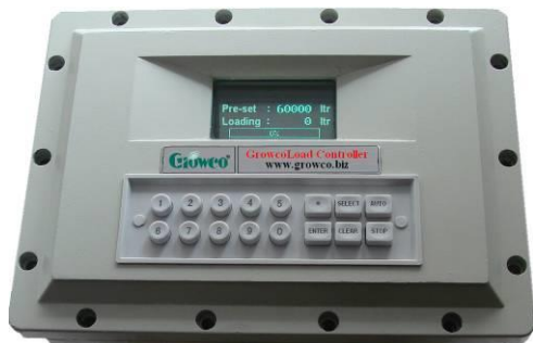
Typical outlook of our GrowcoLoad

The GrowcoLoad GL-E Series Batch Controller is typically used together with flow meters with pulses output and control valves or PLC for loading of products used in trucks loading terminals, barge loading terminals, rail cars, or related processing installations.