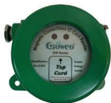
Growco Contactless IC Card Readers