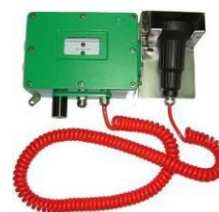
Grounding Plug & Overfill System