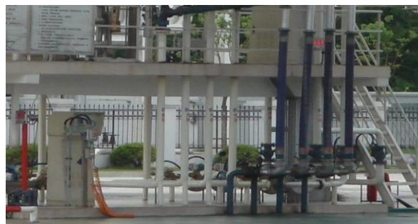
Our Batch Controllers were installed at such petroleum trucks terminals