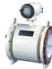
Mag Flow Meter with Integrated Display