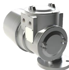
ATG Servo Tank Gauges