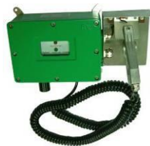
Grounding Clamp & Overfill System