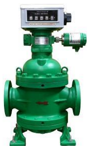
Typical Photograph of LS Series Double Case PD Meter

Growco's have many years of experiences in offering such Total Measurement Solutions to many satisfied clients and do feel free to contact us for your requirements.