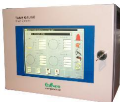
Growco UTG Series Smart Consoles