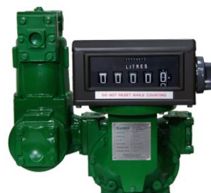
Typical Photograph of LS Series Single Case PD Meter

Our range of LS Series Double Case PD flow meters for flange connection sizes up to 16" in both Vertical and Horizontal Installations. The above photos shown are our typical PD meters and special materials are available on requests.