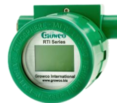
Remote Tank Indicator