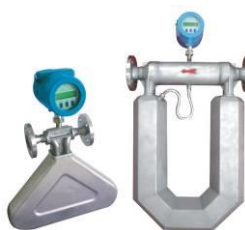
Mass Flow Meters