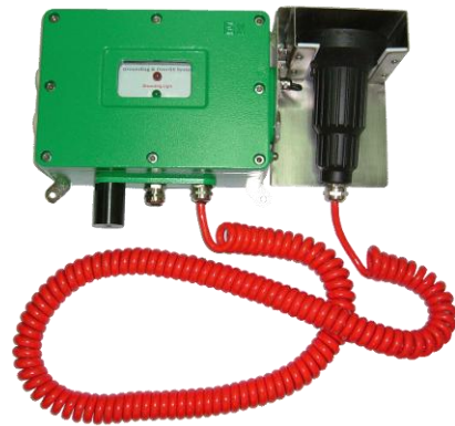
Typical Photograph of GPS Series for Bottom Loading Arm Application