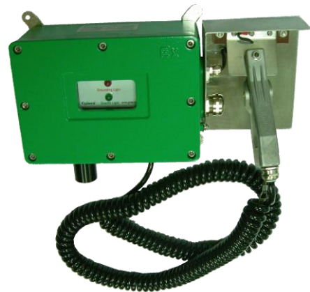
Typical Photograph of GCS Series for Top Loading Arms Application