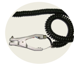
Typical Photograph of Grounding Clamp