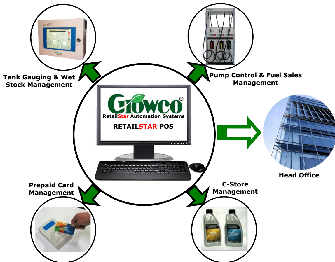
Figure 1: The Solution Architecture of our Automation System