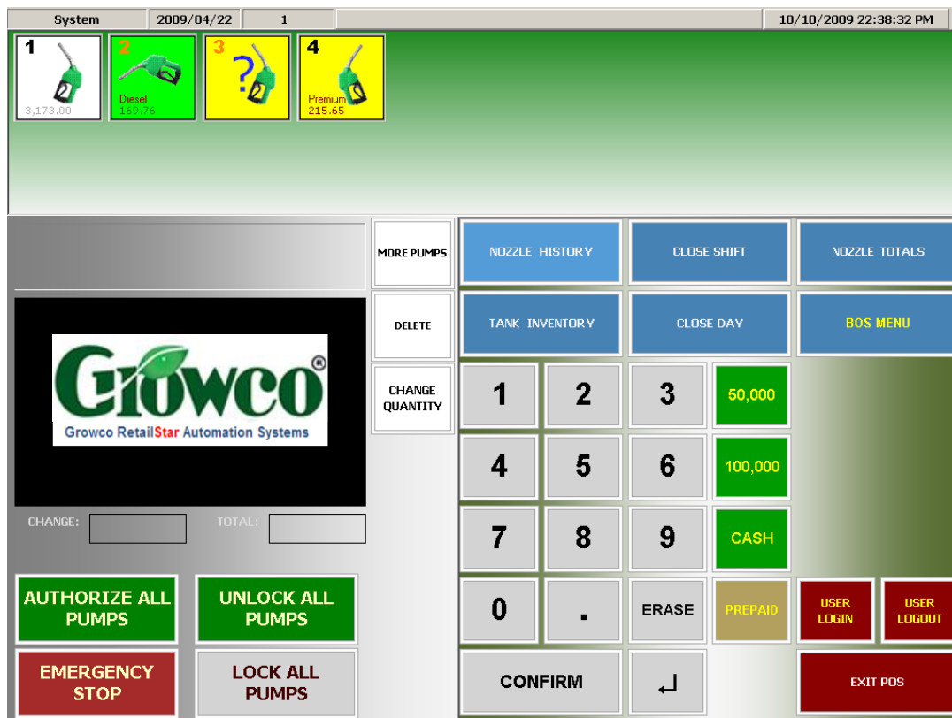
Figure 2: Typical Screenshot of the Main POS As Shown Above.