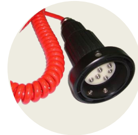
Typical photograph of Grounding & Overfill Prevention Plug