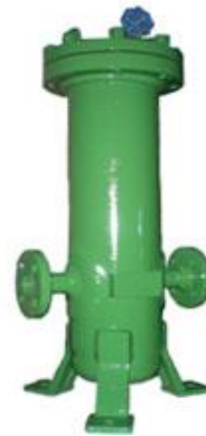
Photograph of Typical LS-AE Series body with built-in air release head