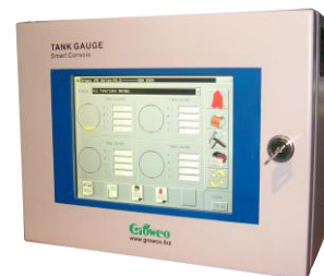
Typical Photograph of Smart Console with Colour Touch Screen