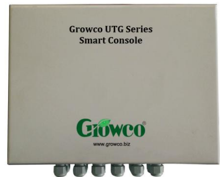
Typical Photograph Of Smart Console Box With User Friendly PC Remote Software