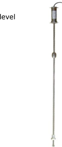
Typical Photograph of Smart Magnetostrictive Probe