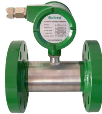
Typical Photograph of Growco Turbine Meter