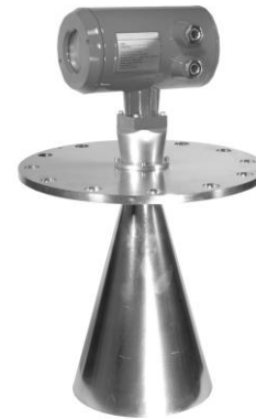
Typical Photograph of Growco Smart Radar Level Gauge