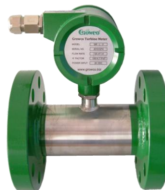
Typical Photograph of Growco Turbine Meter