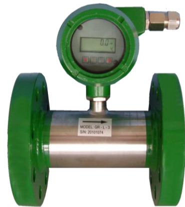
Typical Photograph of Growco Turbine Meter with Local Display

TOTAL MEASUREMENT SOLUTIONS PROVIDER Member of Singapore Manufacturing Federation (Since 1932)