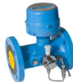
Typical Photograph of Fuel Gas Turbine Flowmeter