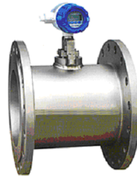
Typical Photograph of VT Series with integral Display